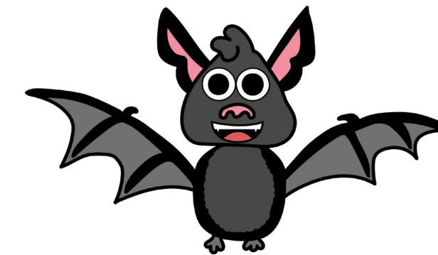
BINGO THE BAT Now Loves the night time. She can see in the dark, but also Loves hanging around in the daytime.