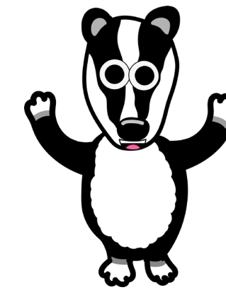
BENARD THE BADGER I now love my home sett. I also love my new friends.