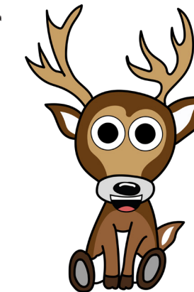
WILLOW THE DEER Now has friends. She Loves being with her friends and is a great Listener.