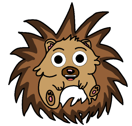
BLOSSOM THE HEDGEHOG Now Loves hedges. She also Loves to roll around in a ball.