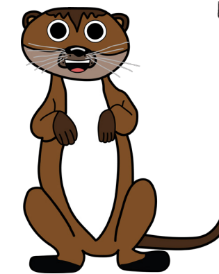
SKYE THE OTTER Now Loves water. She is a super swimmer and the joker of the Goofballs.