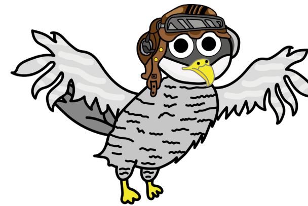
GEOFF THE PEREGRINE Now Loves to fly high. He is a great flyer and very wise.